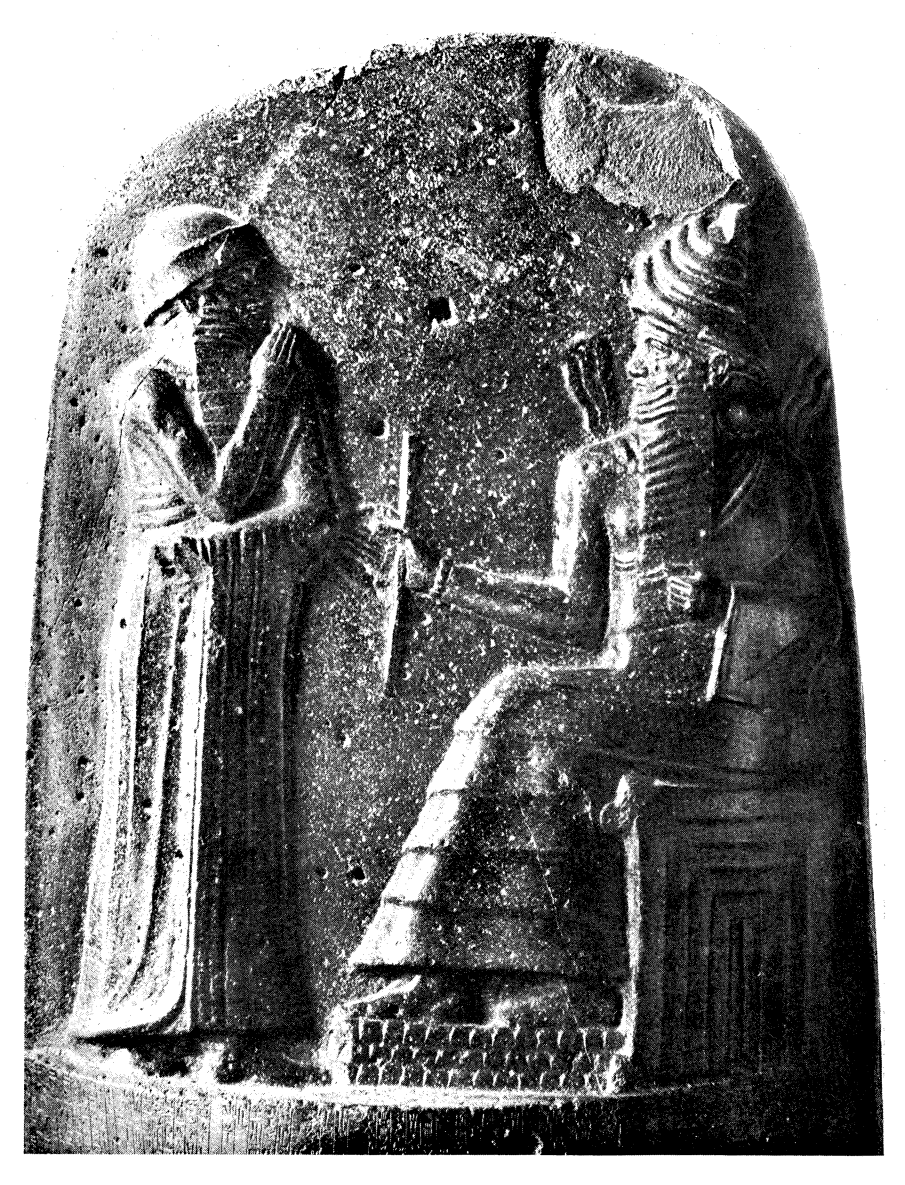
HAMMURABI RECEIVING THE CODE FROM THE SUN GOD.